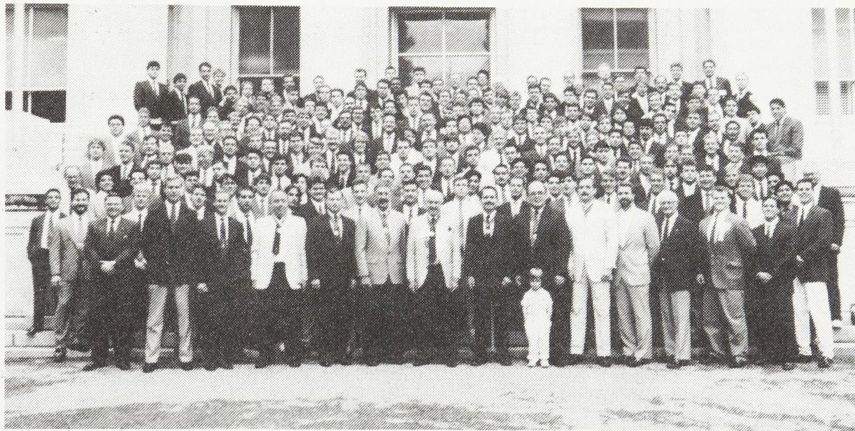
"CREATING OUR FUTURE TODAY" - THE ALPHA SIG WAY

The recently concluded 1990 National Leadership Conference & Convention, CREATING OUR FUTURE TODAY , was a huge success. As one brother put it, "I've been to many conferences and training sessions, but this was the best one I've ever attended."