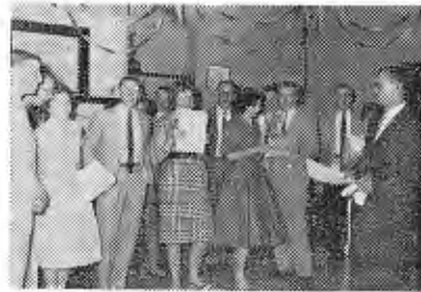
Alpha Sigs Sing . . . and very heartily, too! Never does one of the chapter's fabulous parties go by without the group gathering in song.

Alpha Psi was well represented at the annual Black and White Ball, at Southern Pines, a North Carolina resort. Sharing the festivities with the PC'uns were