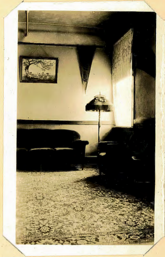
A favorite corner of our hall.