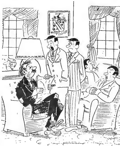
"Beg pardon, sir, but we always like to know the years our visiting alums were in college. I presume yours were '29 or '30?"