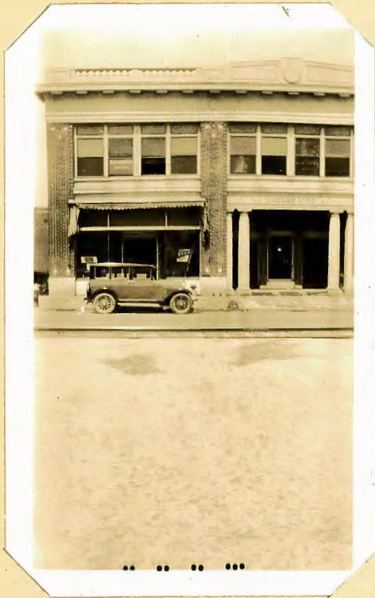
Jacobs Building. Where our hall is located.