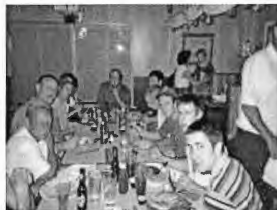
Brothers and Alumni enjoying dinner on the first night of the Alpha Sig Golf Safari.

*Every Monday and Tuesday Alpha Sigma Phi has study sessions in the library from 9:00-10:00. Meet between 7:00 and 7:30 at I Love NY Pizza for dinner.