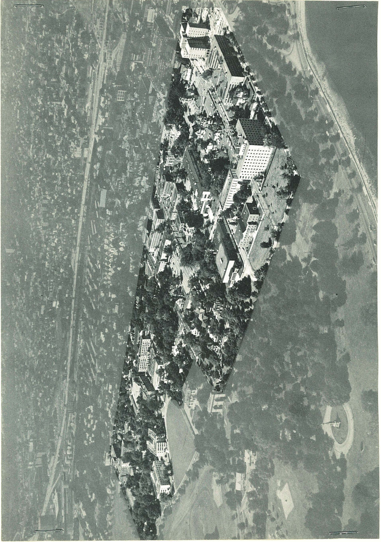
VIEW OF THE UNIVERSITY OF BRIDGEPORT CAMPUS