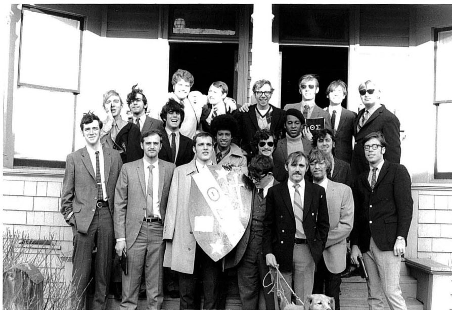
APR • 70