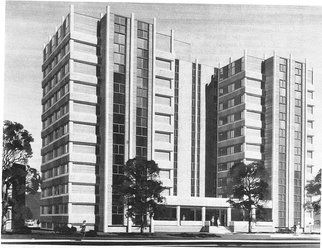
The University of Bridgeport will construct a 10-story residence hall for 468 women at a cost of approximately $3,000,000. Construction will begin in the spring of 1969 with occupancy scheduled for Sept., 1970. "Cluster" units of eight double and one single room grouped around a lounge, study area and bathroom facilities in each of the three wings on each floor will provide the students with a more intimate living area. The building will be financed through loans including $2,000,000 made available from the U.S. Dept. of Housing and Urban Development. The firm of Chas. Wellington Walker Associates is architect for the project.