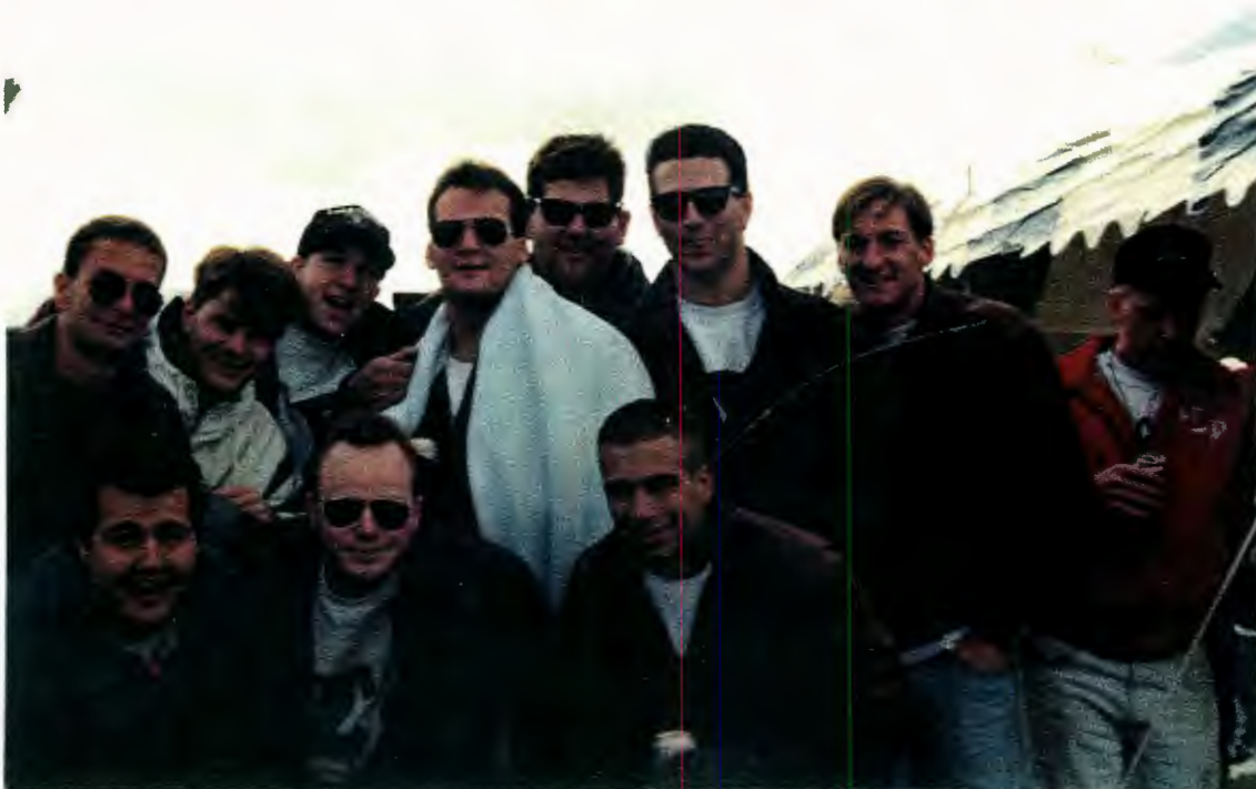
Posing for a picture during Homecoming 1992