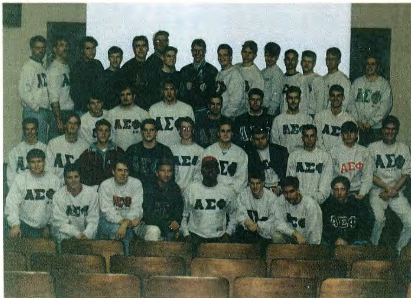
The Brothers of Alpha Sigma Phi, Phi Kappa Colony