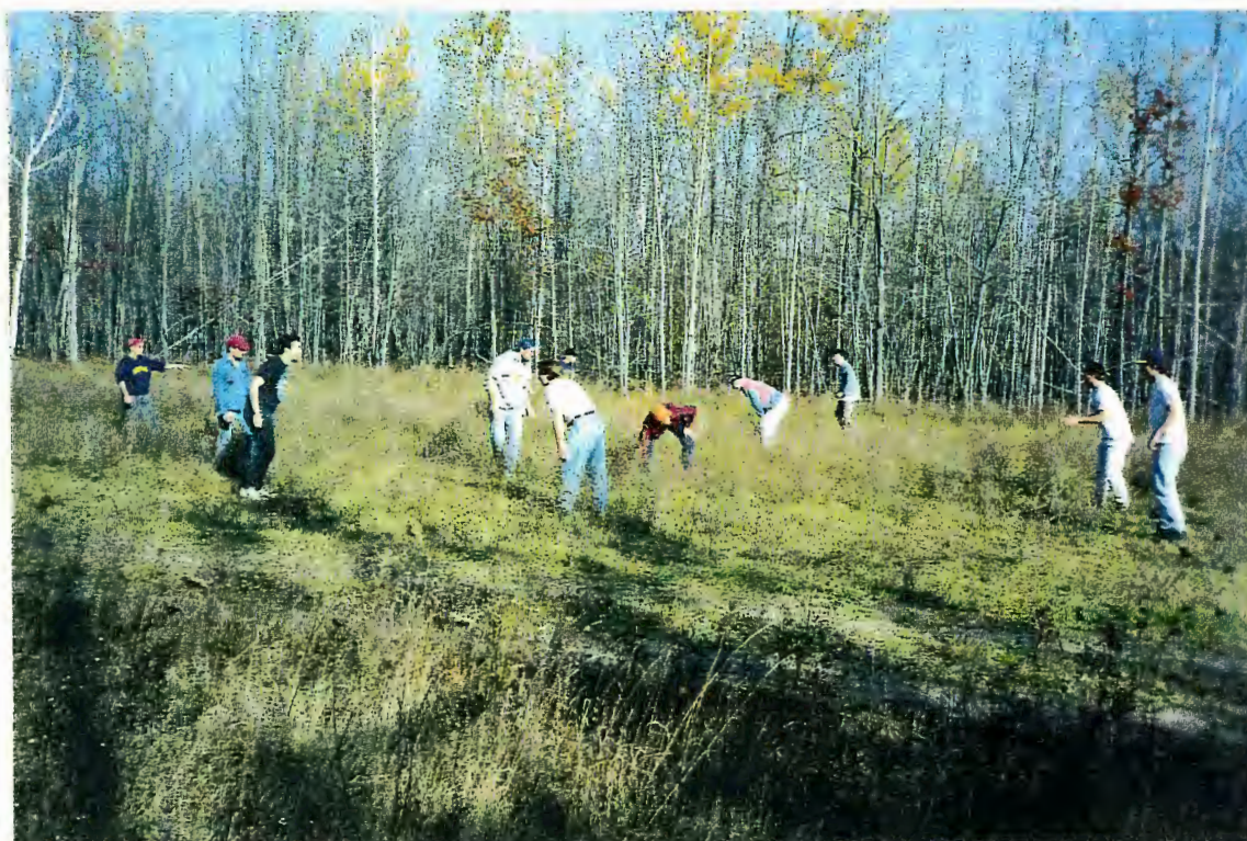
Stretching the limbs with a little football