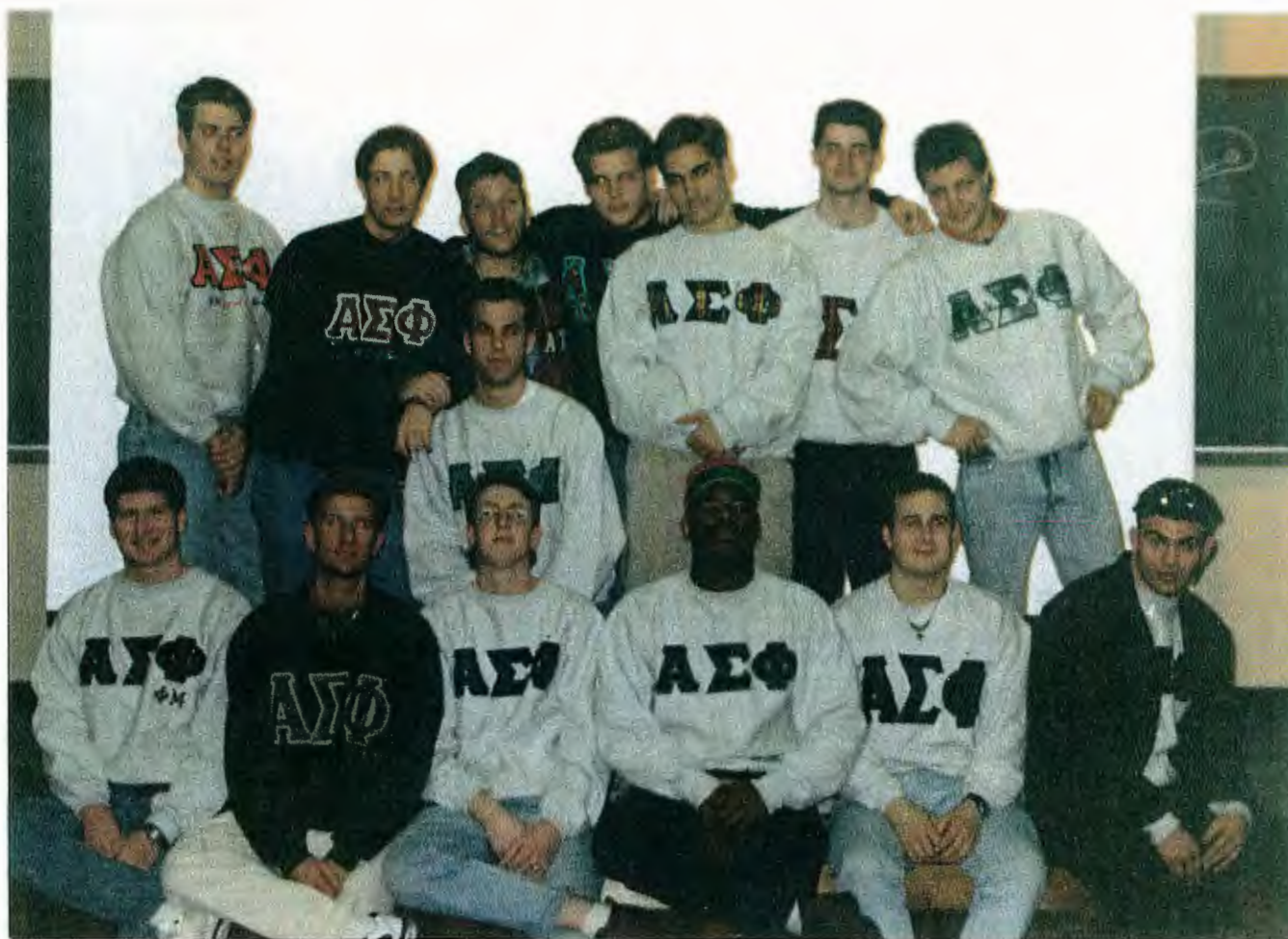
The Pledge Class of Phi Kappa Colony, Spring 1993