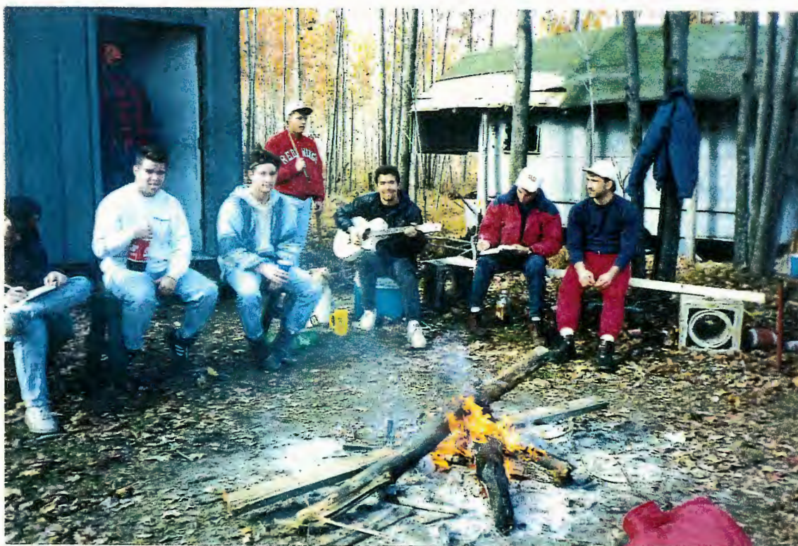
Sitting around the fire during the semester outing