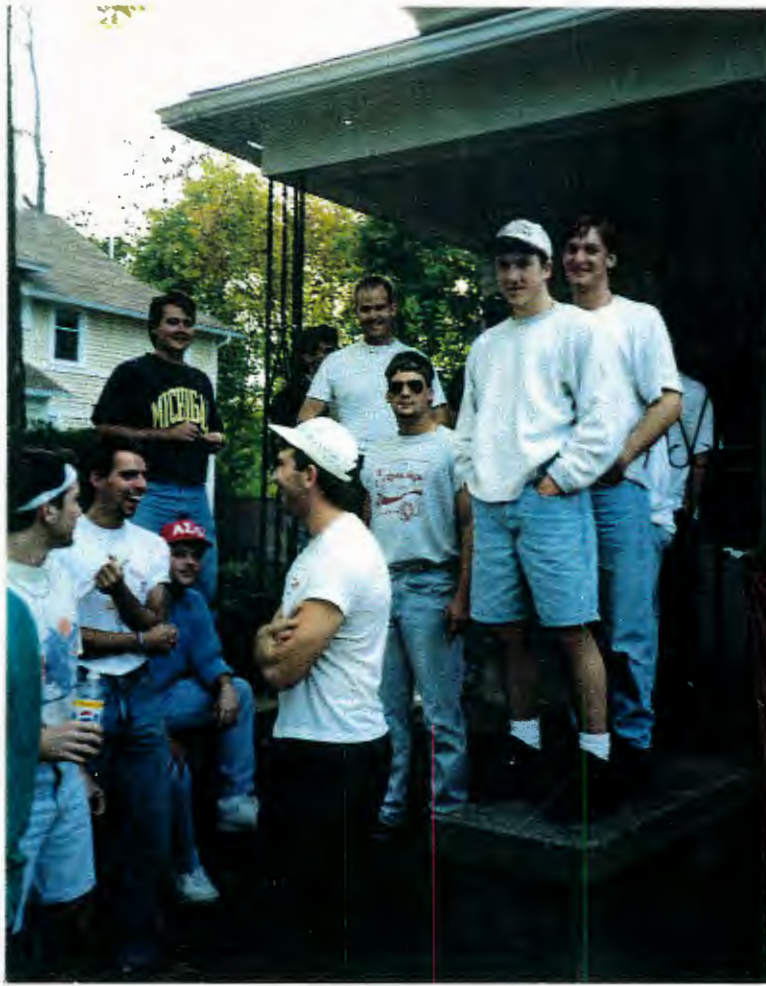
Hanging out on the porch on a summer afternoon