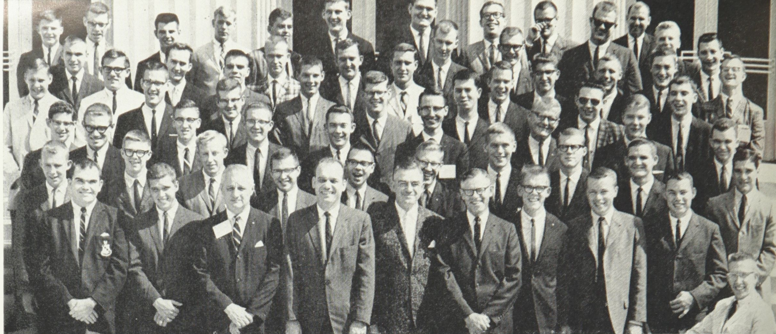
SOME OF DELEGATES and leaders attending summer Educational Conference pose in front of main building on Morris-Harvey campus.