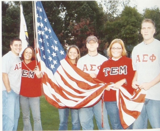
Members of the Epsilon Theta chapter at Otterbein College on September 27 with Tau Epsilon Mu sorority sisters, at a home football game. The brothers are responsible for the raising of the American flag at all home games.