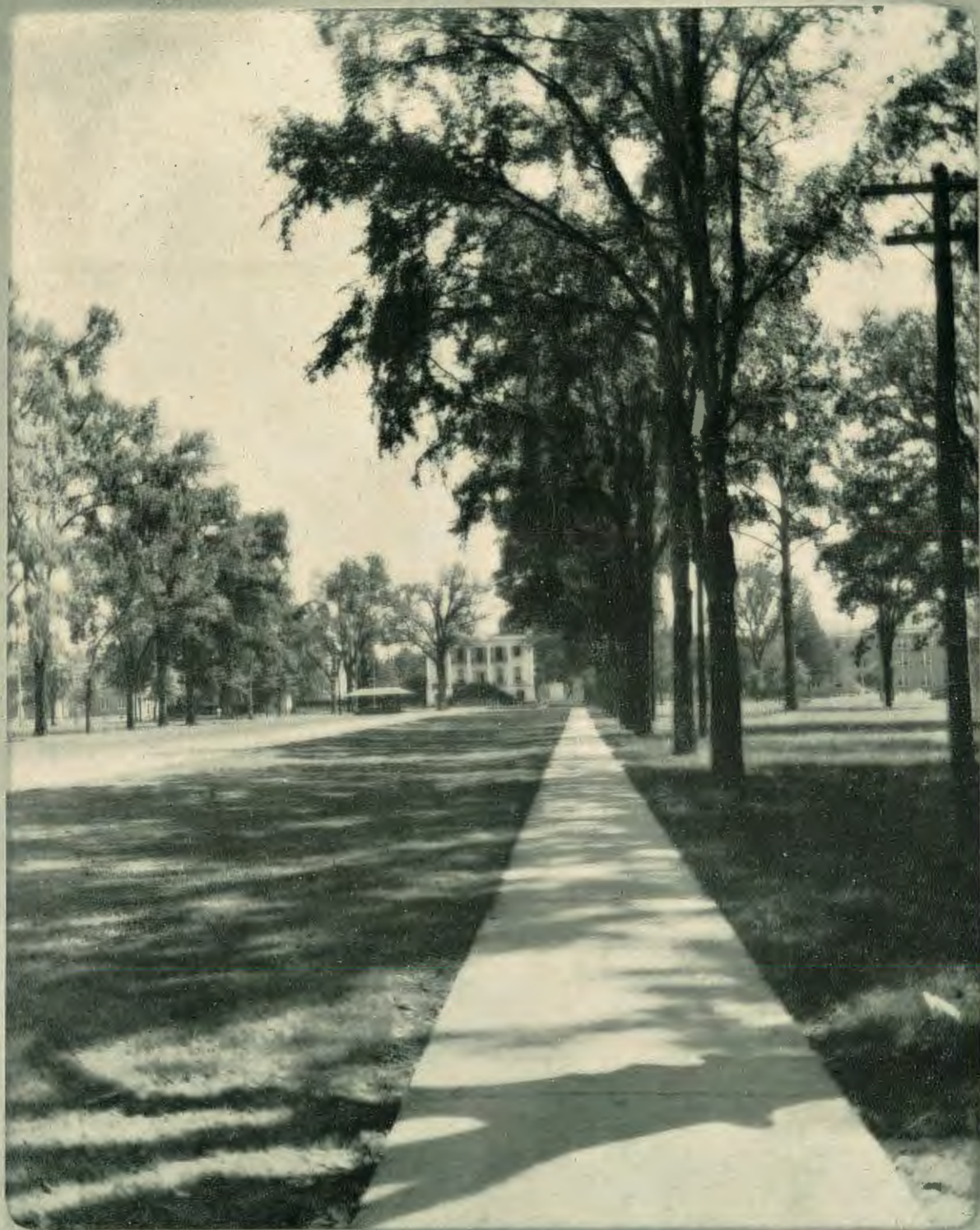
Along the Drive