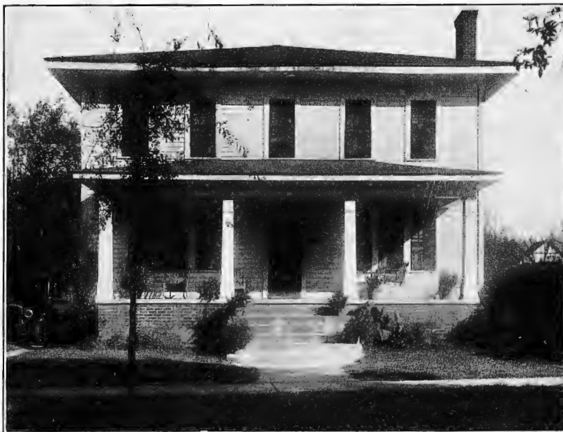
OUR PRESENT HOME