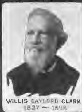
WILLIS GAYLORD CLARK 1827 — 1898