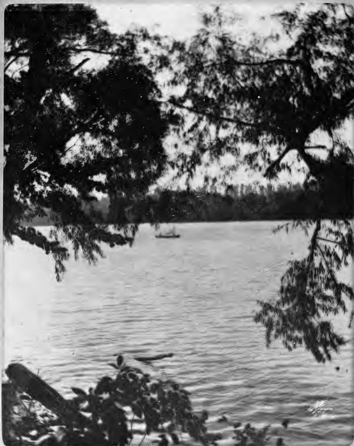
On the Warrior