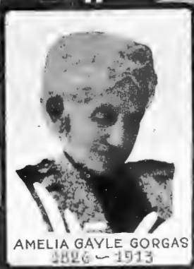
Gorgas Memorial Library