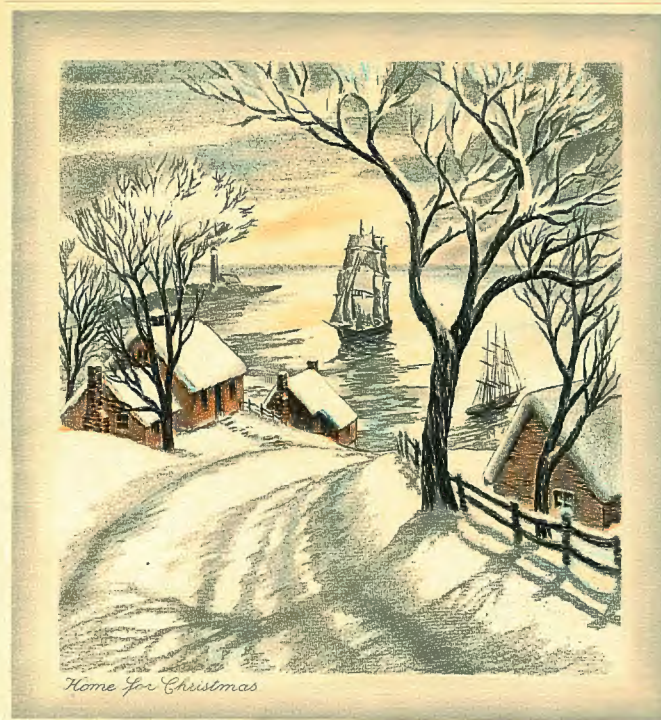
Home for Christmas