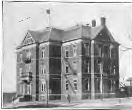
The Old Science Hall. Another one of the older buildings of the University.