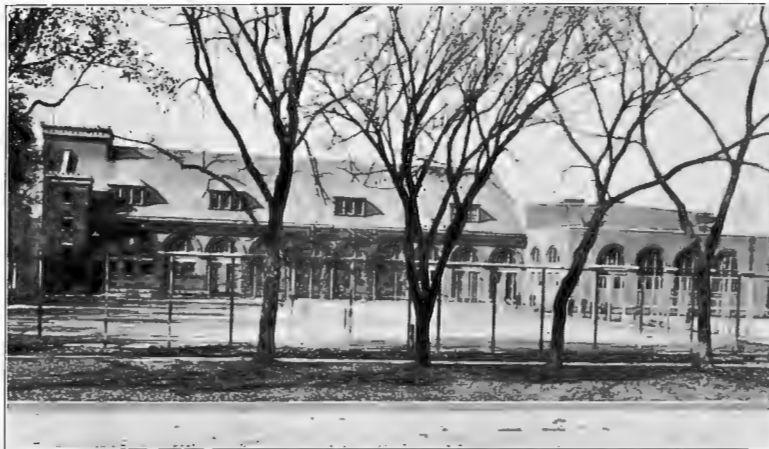
The Men's Gymnasium is supplied with all needful apparatus and also contains a large swimming pool.