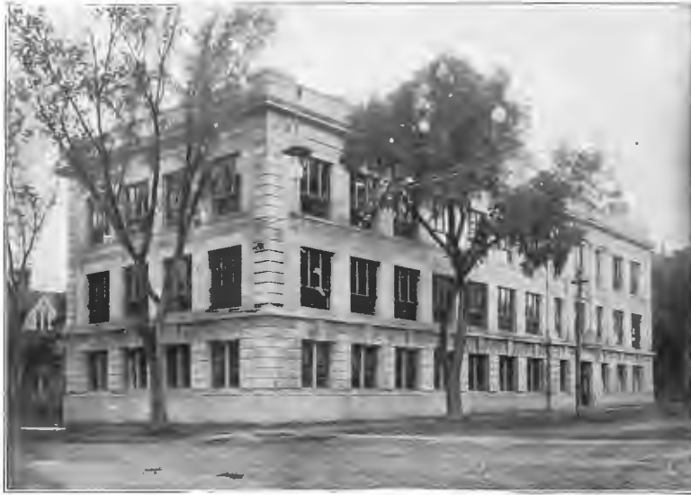
Medical Building and Laboratories.