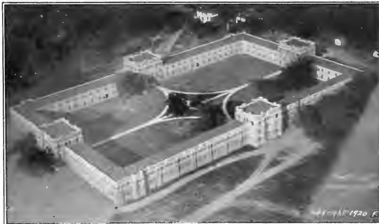
Aeroplane view of the Quadrangle, or Men's Dormitory, which accommodates 300 men. On the west bluffs of the Iowa River, near the huge new Armory.