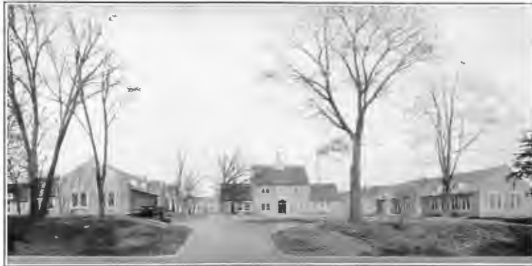
The Children's Hospital under University supervision. Crippled and sick children are treated free at the expense of the state. Few like this in the United States.