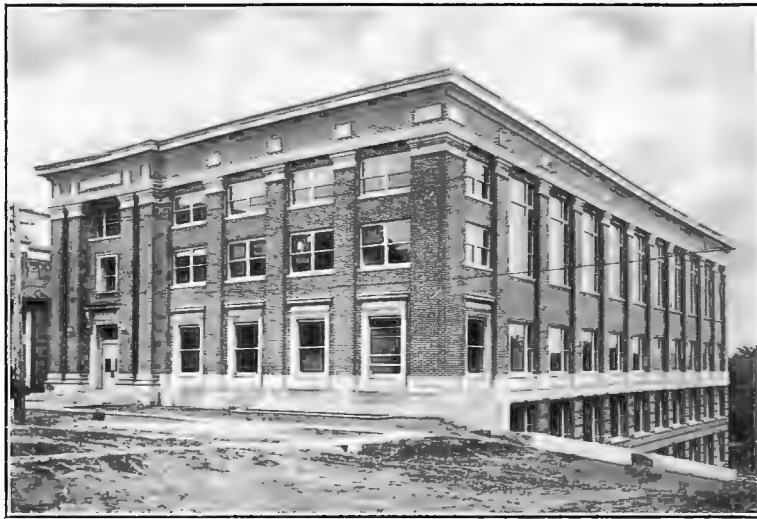
The Dental Building. One of the finest in the middle west.