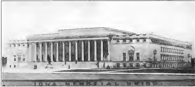
The Iowa Memorial Union. A million dollar structure for Iowa.