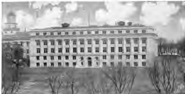
The Physics Building is one of the most beautiful buildings of the University. Fully equipped with laboratories and modern apparatus.