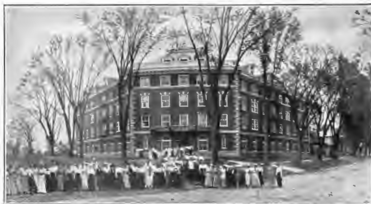
Currier Hall is the women's dormitories, which accommodate 200 girls.