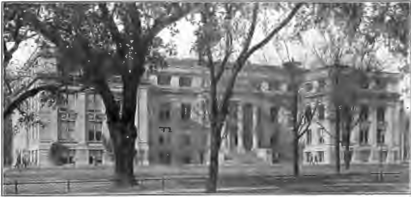
The Hall of Natural Science