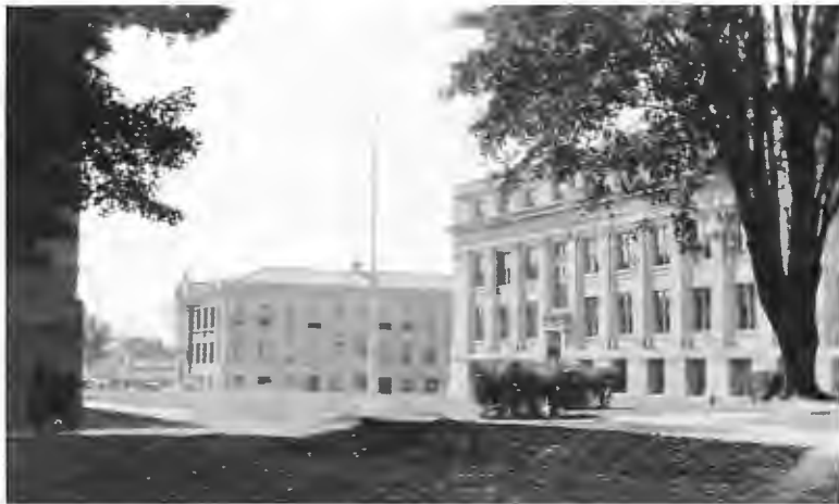
Campus scene. Physics and Engineering buildings partially showing.