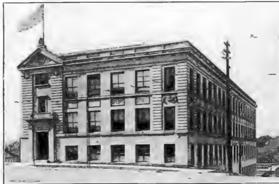
The Hall of Engineering. Laboratories. Shops are in rear of building.