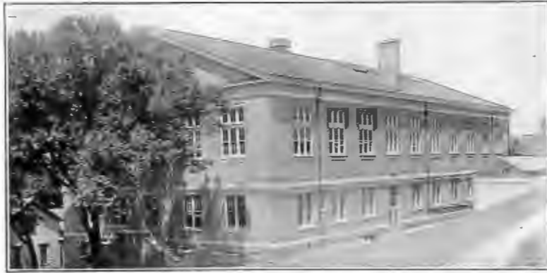
The Women's Gymnasium is one of the newest and best equipped in the country. It has a large swimming pool.