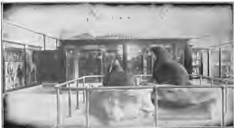
Mammal Museum in Natural Science Building