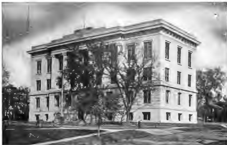
The Law Building, another building of Bedford stone, first occupied in 1910. Large law library on top floor.