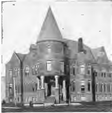
Close Hall, one of the older buildings of the campus.