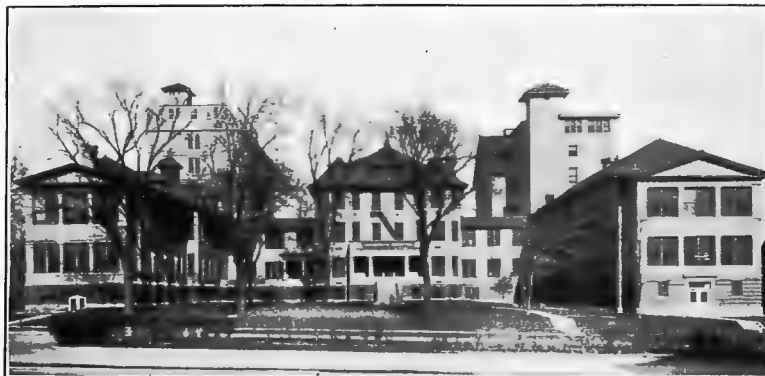
One of the University's five hospitals, the General Hospital.