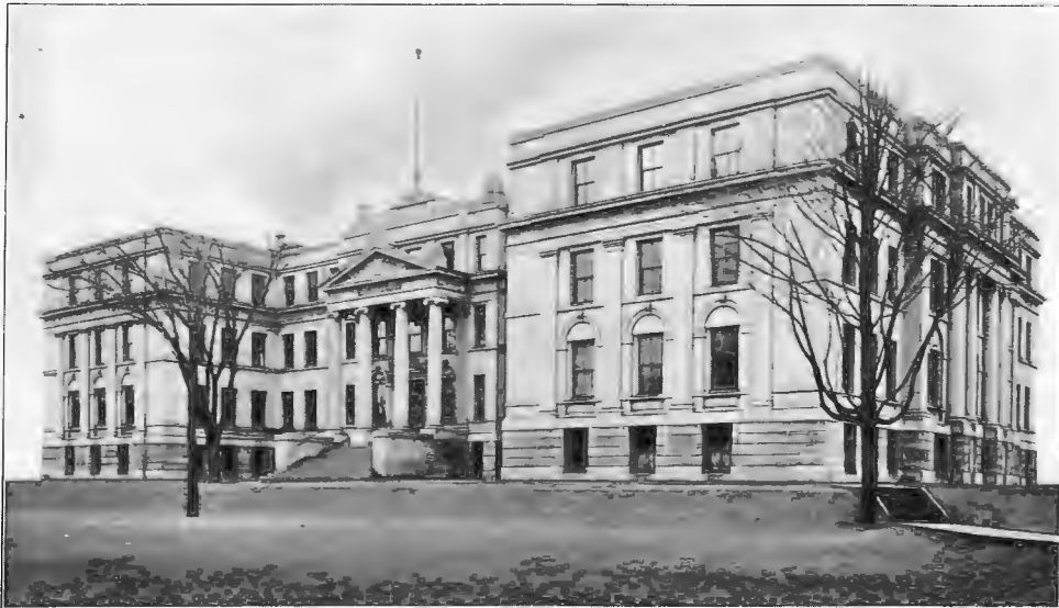
The Hall of Liberal Arts. Constructed of Bedford limestone, cornerstone laid in 1898.