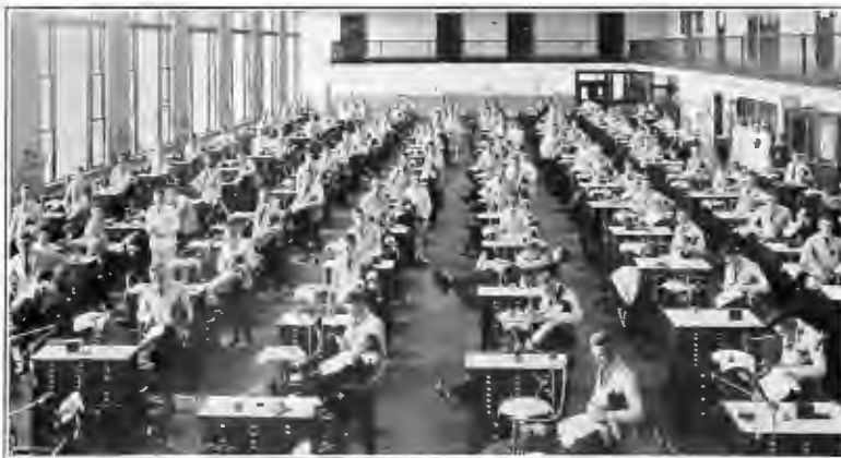
The Dental Infirmary. Chairs for 140 patients.