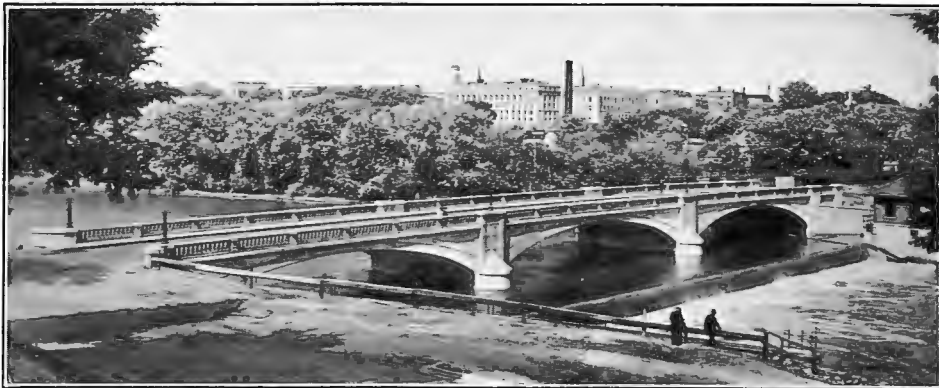
The University occupies a campus of more than 100 acres, and is almost divided in two by the Iowa River. This picture shows the lower bridge, and University Dam with Power House at farther end. Hydraulic Testing Plant just out of picture. Back of the trees can be seen a few of the University buildings.