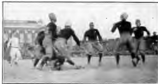
Action in Iowa Football