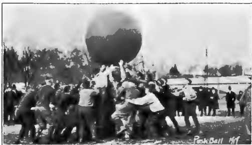
A Pushball Contest