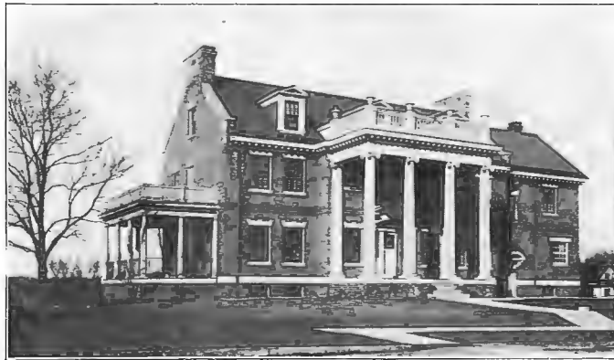
The President's Home