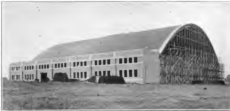
The New Armory, now finishing construction. Cost is over $400,000.