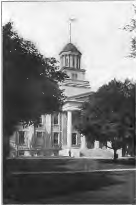
The Old Capitol. Once used as the state capitol building of Iowa when Iowa City was capital city. Administration offices are now located in the building.