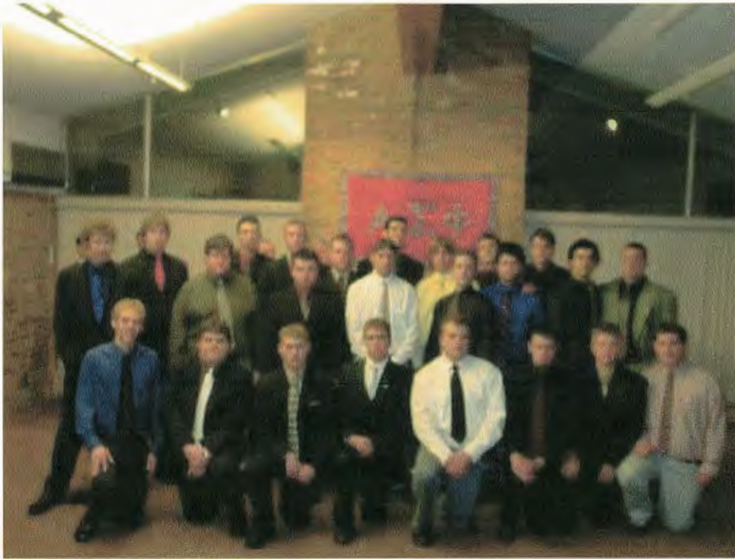
Gamma Psi Colony at Pledge Initiation Ceremony, February 13, 2004