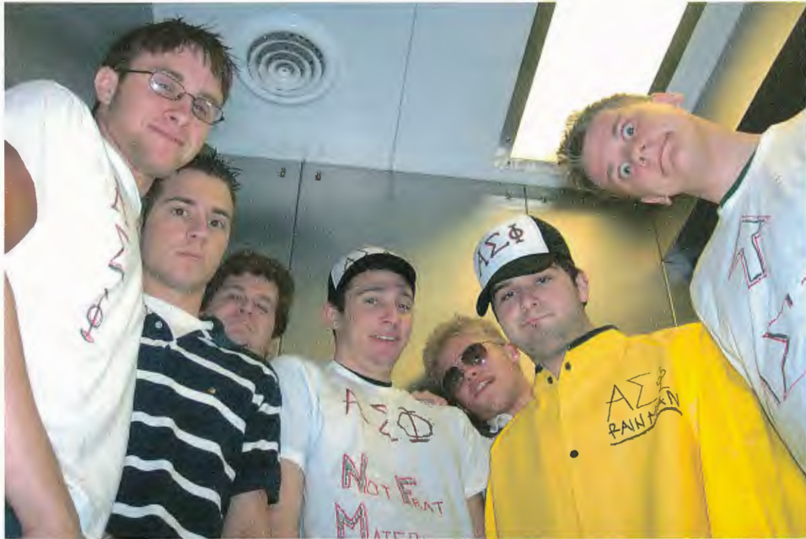
Posing for a picture on Greek Day 2004