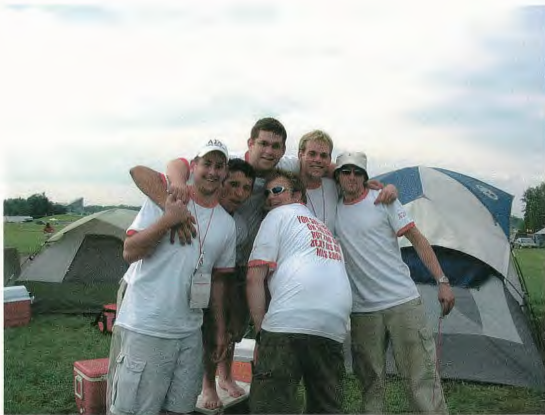
Brothers posing for a picture while camping at Michigan International Speedway