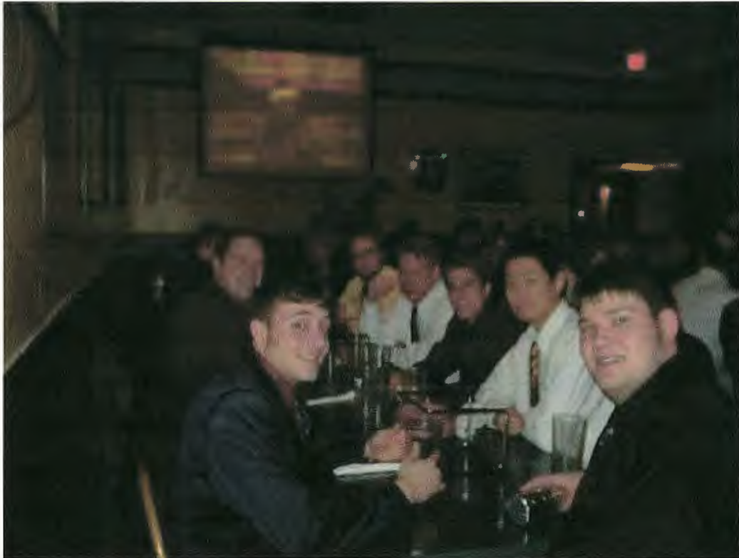
Dinner after the Pledging Ceremony 2004 with the Western Michigan Chapter and Alumni