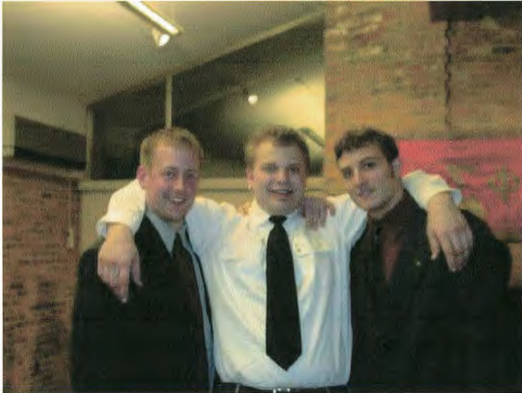
The Three Founding Fathers