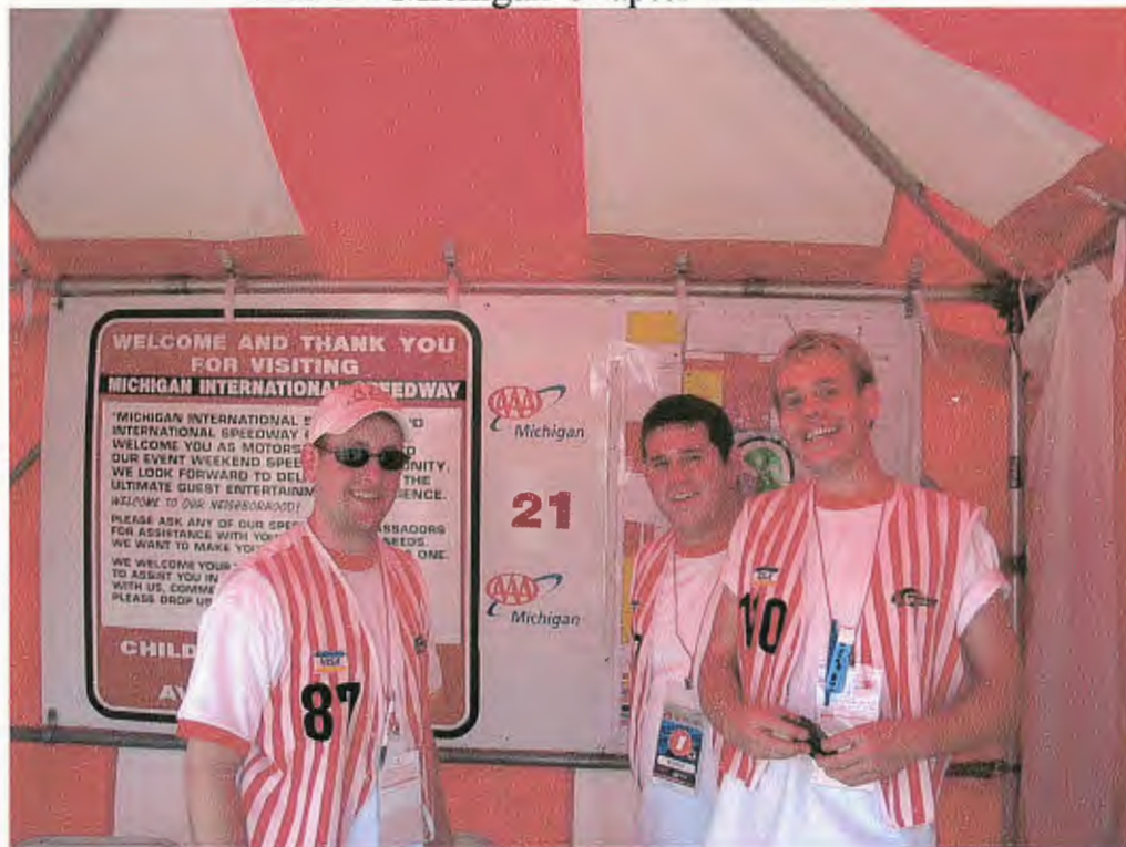
Brothers fundraising at the Michigan International Speedway in the Information Tent