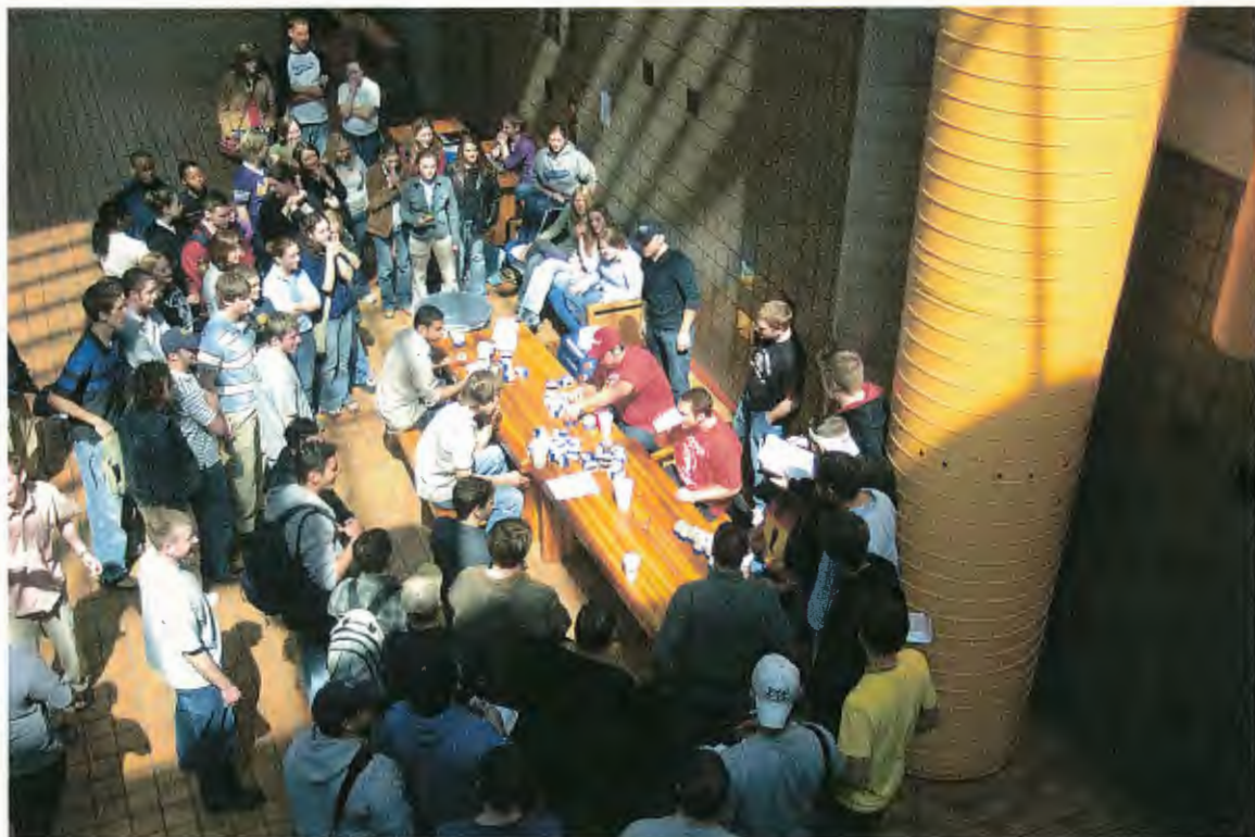
Participating in Greek Week 2004