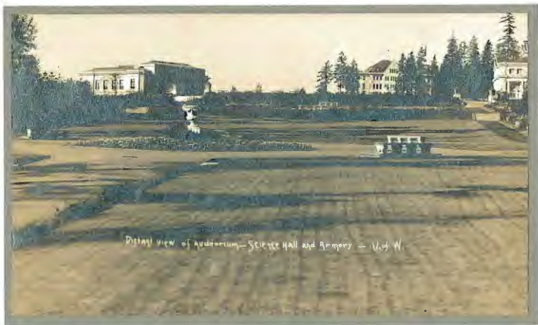
Dist. view of Auditorium—Science Hall and Armory — View W.